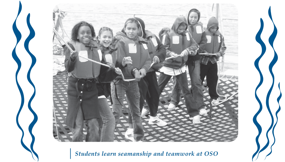
Students learn seamanship and teamwork at OSO

Will my gift stay with the program permanently? O'Neill Sea Odyssey's endowment at the Community Foundation