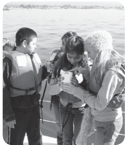
| Santa Theresa students bring their marine science unit study to life.

ment. The OSO teacher's packet includes plankton identification information, food web charts and activities, marine science vocabulary lists in English and Spanish, and other activities that facilitate integration of marine science into the classroom.